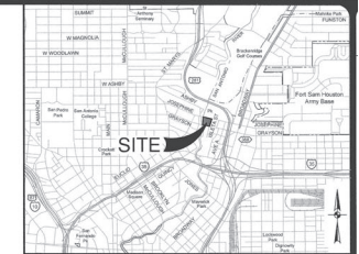
LOCATION MAP NOT-TO-SCALE